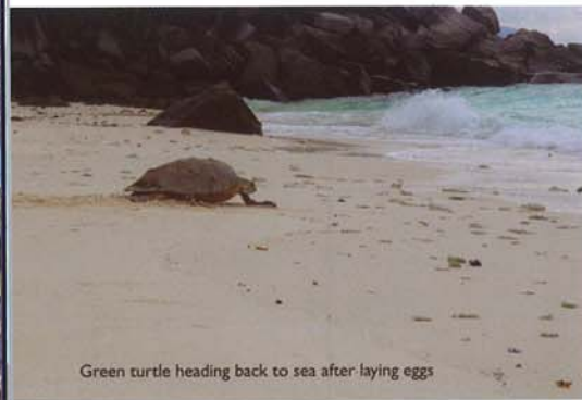
Green turtle heading back to sea after laying eggs