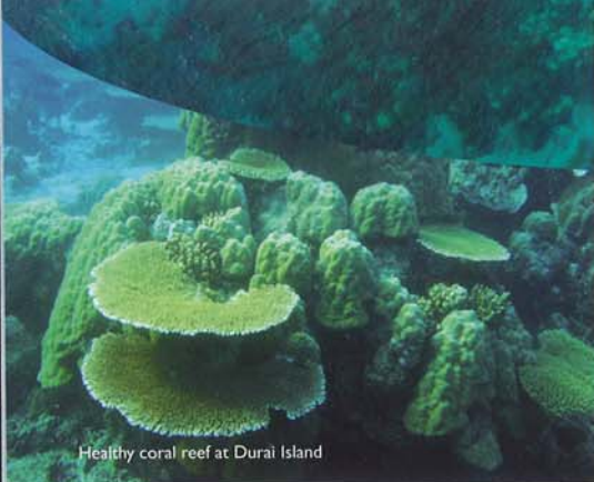
Healthy coral reef at Durai Island

A newly formed Marine Protected Area has been developed for Anambas Islands, taking it to new heights in the overall marine conservation for Southeast Asia. By Abigail Alling